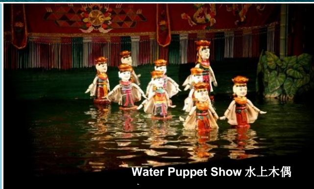
Water Puppet Show 水上木偶