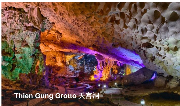
Thien Gung Grotto 天宫洞