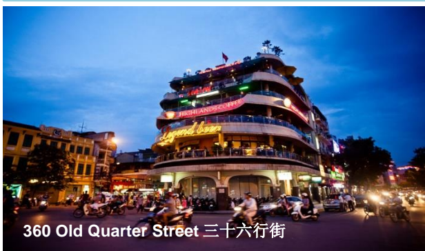
360 Old Quarter Street 三十六行街