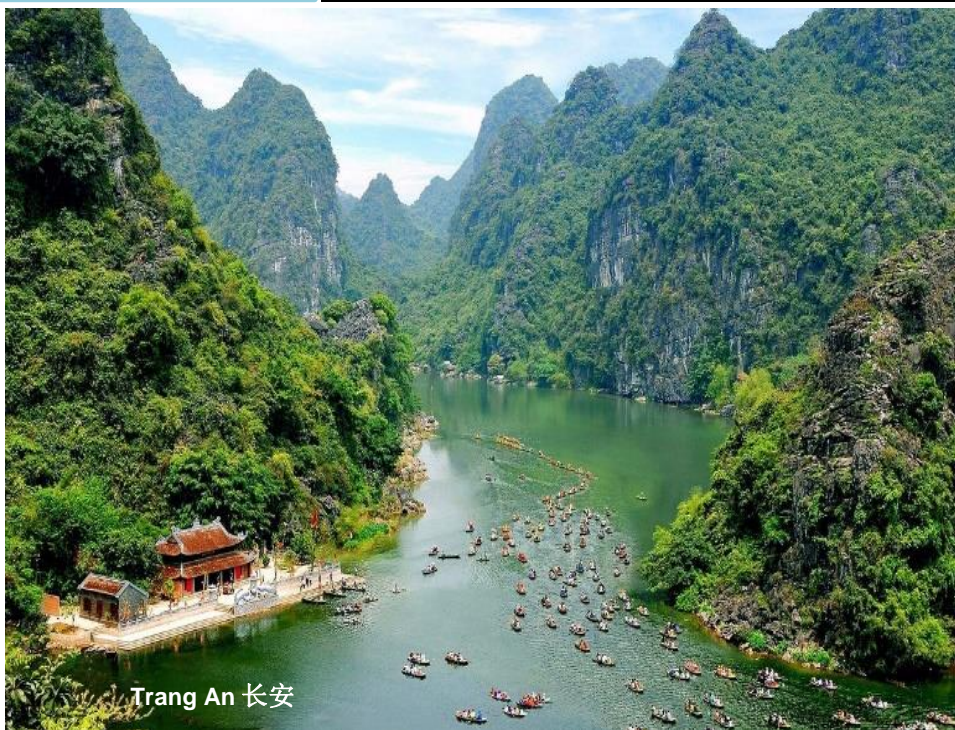
Trang An 长安