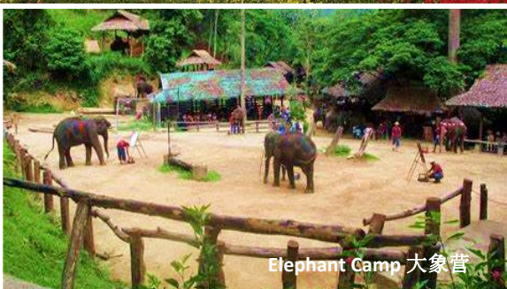
Elephant Camp 大象营