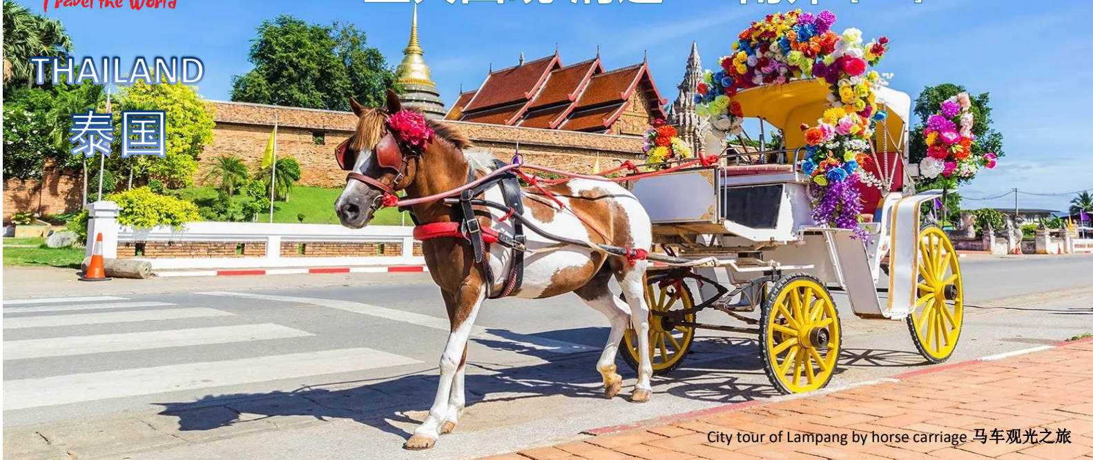
City tour of Lampang by horse carriage 马车观光之旅