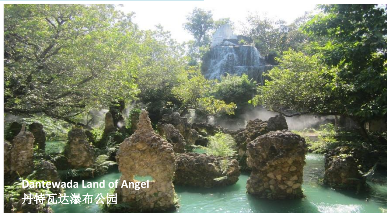
Dantewada Land of Angel 丹特瓦达瀑布公园