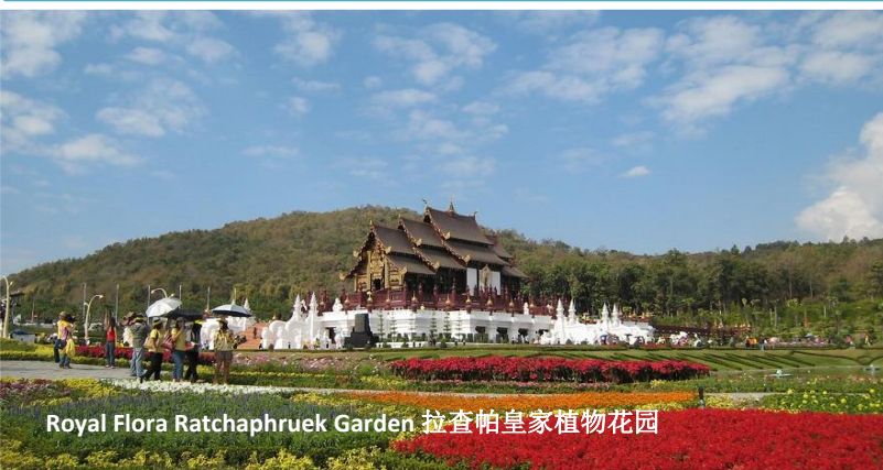
Royal Flora Ratchaphruek Garden 拉查帕皇家植物花园