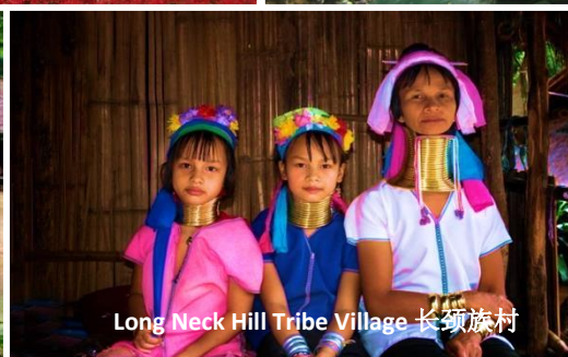
Long Neck Hill Tribe Village 长颈族村