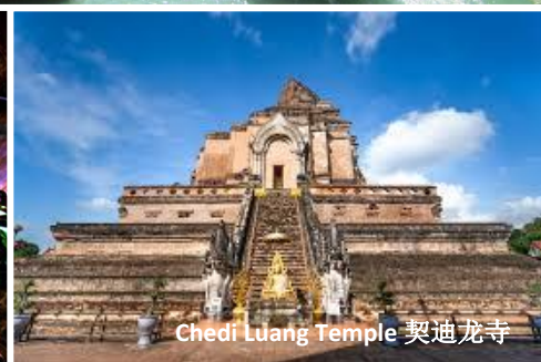
Chedi Luang Temple 契迪龙寺