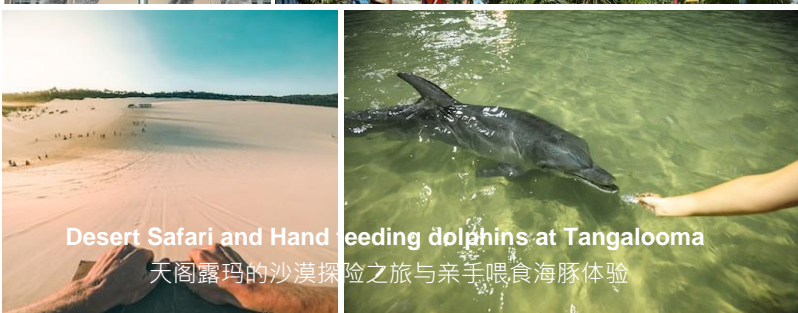
Desert Safari and Hand feeding dolphins at Tangalooma 天阁露玛的沙漠探险之旅与亲手喂食海豚体验