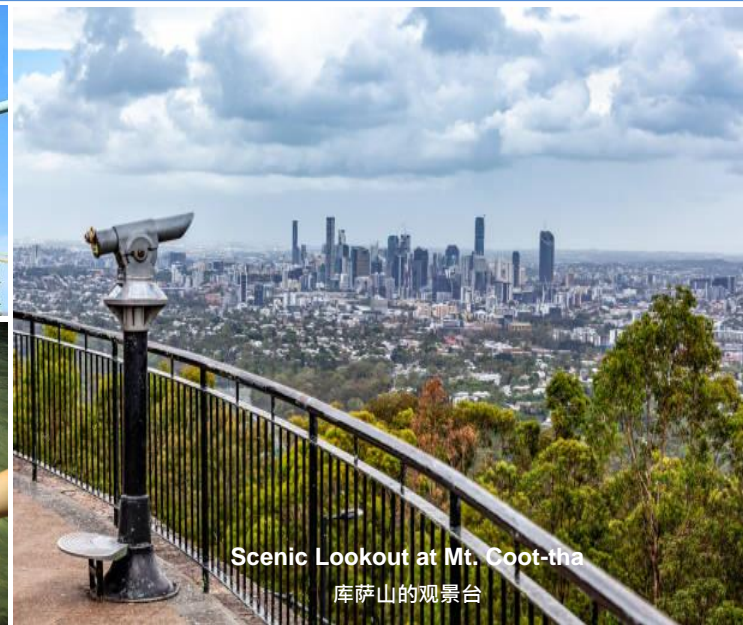
Scenic Lookout at Mt. Coot-tha 库萨山的观景台