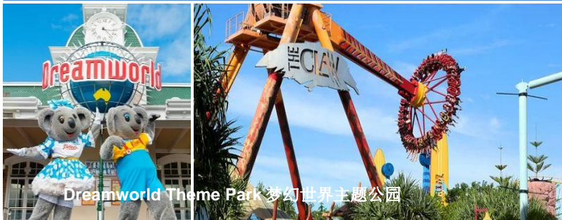
Dreamworld Theme Park 梦幻世界主题公园