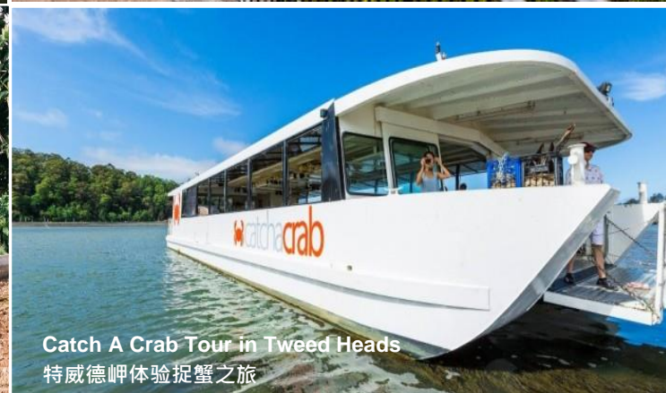
Catch A Crab Tour in Tweed Heads 特威德岬体验捉蟹之旅