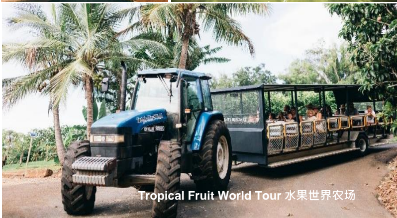
Tropical Fruit World Tour 水果世界农场