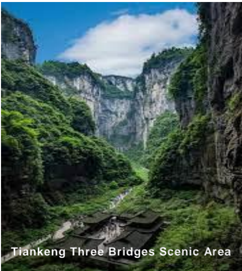
Tiankeng Three Bridges Scenic Area