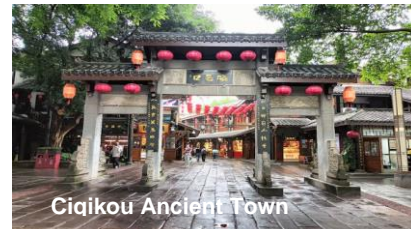
Ciqikou Ancient Town