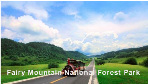
Fairy Mountain National Forest Park