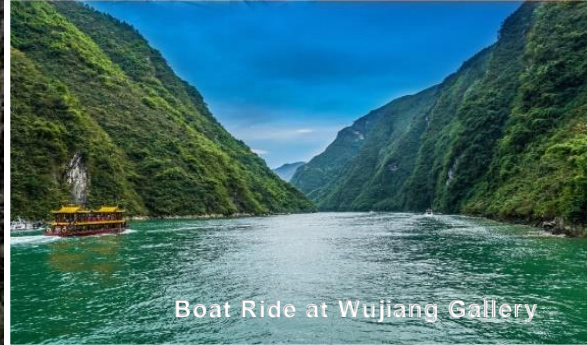
Boat Ride at Wujiang Gallery