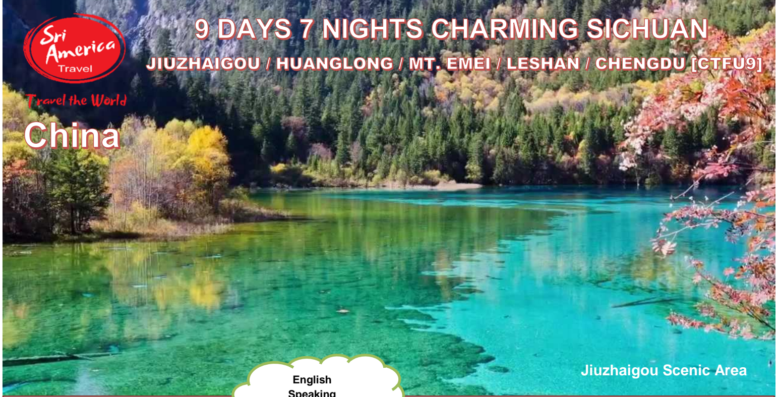
Jiuzhaigou Scenic Area