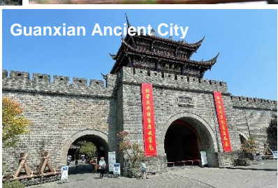
Guanxian Ancient City