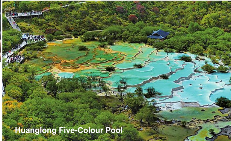
Huanglong Five-Colour Pool