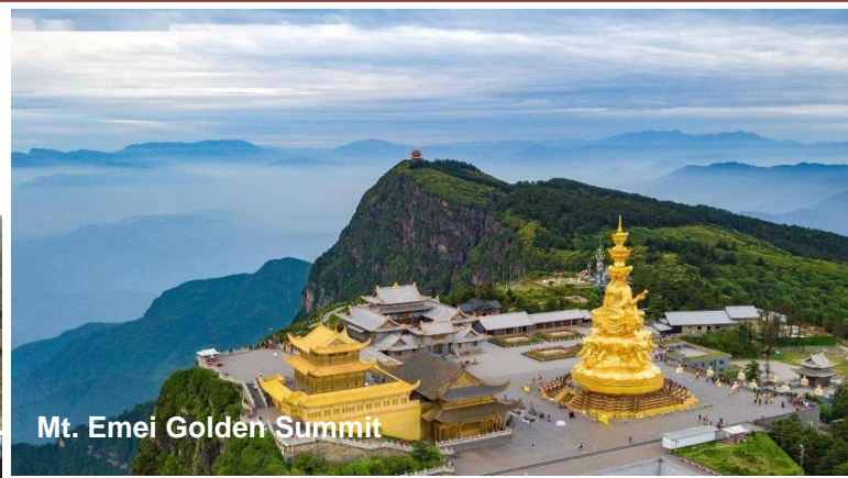
Mt. Emei Golden Summit