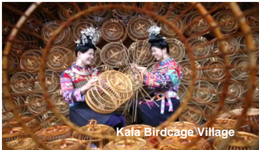
Kafa Birdcage Village