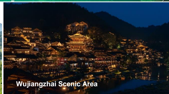
Wujiangzhai Scenic Area