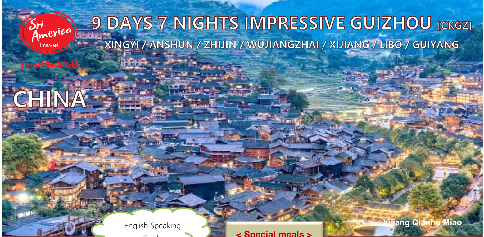
Xijiang Qianhu Miao