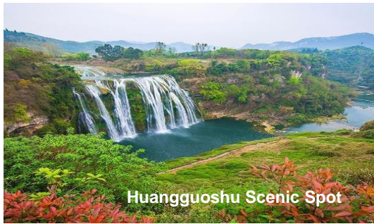
Huangguoshu Scenic Spot