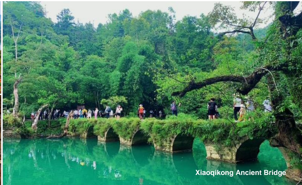
Xiaoqikong Ancient Bridge