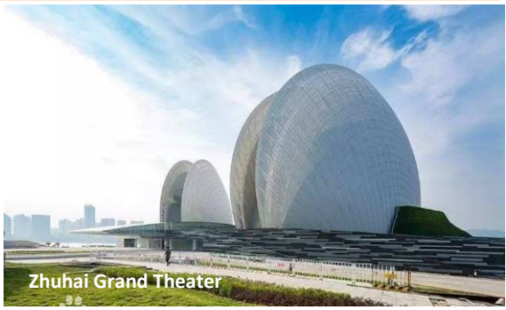
Zhuhai Grand Theater