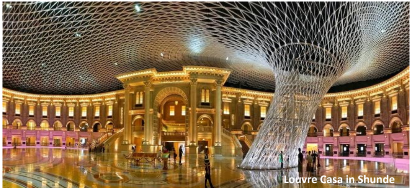
Louvre Casa in Shunde