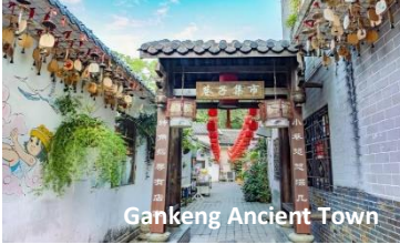
Gankeng Ancient Town