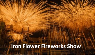
Iron Flower Fireworks Show