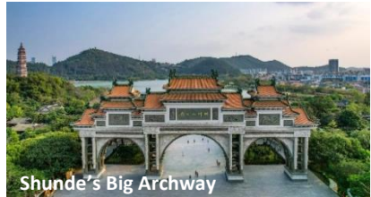
Shunde's Big Archway