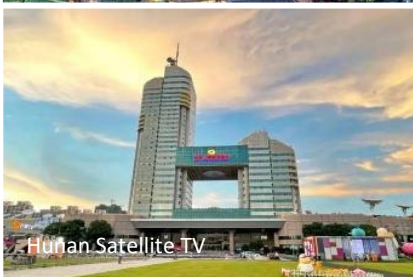
Hunan Satellite TV