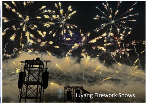
Liuyang Firework Shows