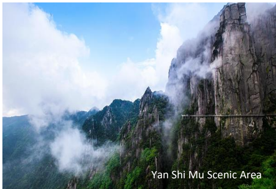
Yan Shi Mu Scenic Area