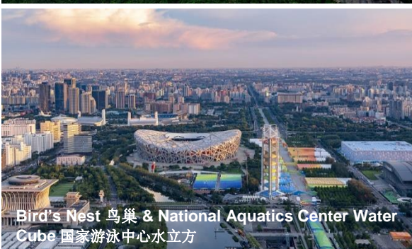
Bird's Nest 鸟巢 & National Aquatics Center Water Cube 国家游泳中心水立方