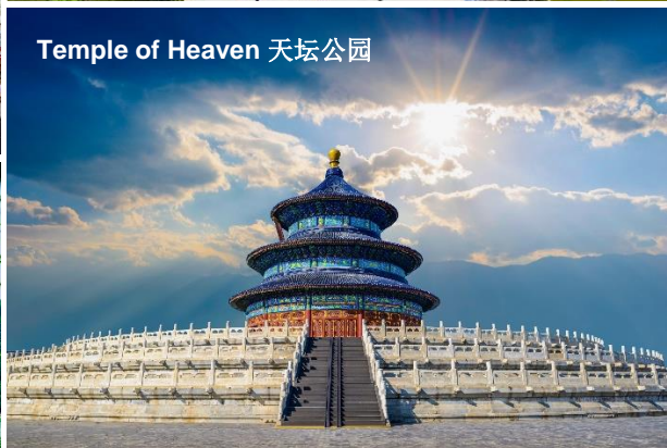
Temple of Heaven 天坛公园