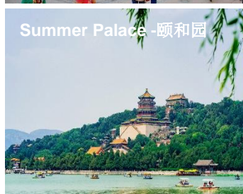
Summer Palace - 颐和园