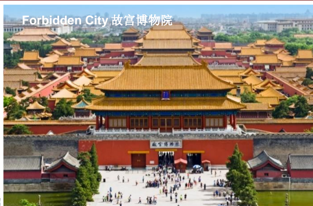
Forbidden City 故宫博物院