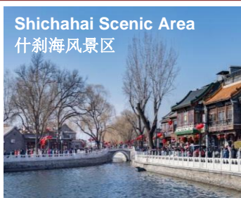
Shichahai Scenic Area 什刹海风景区