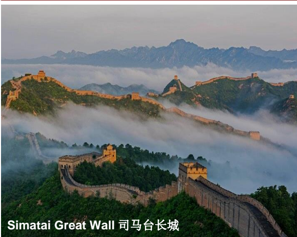
Simatai Great Wall 司马台长城