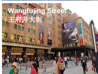
Wangfujing Street 王府井大街