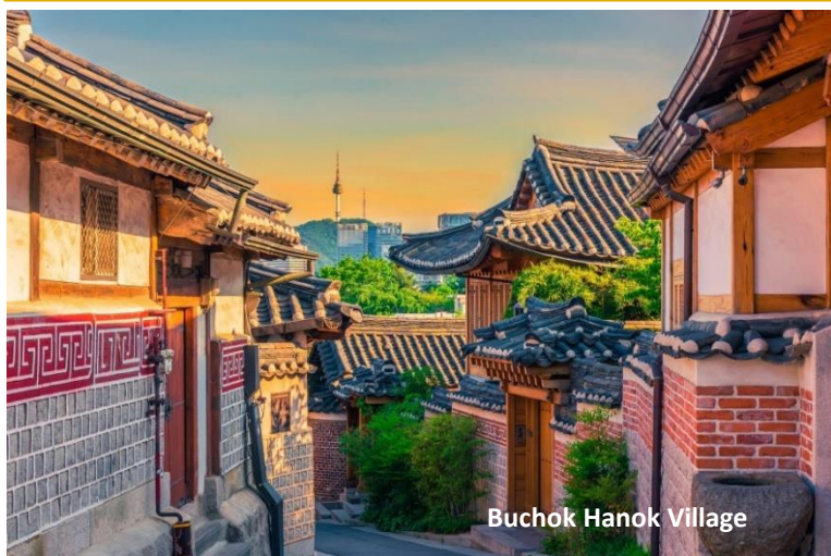
Buchok Hanok Village