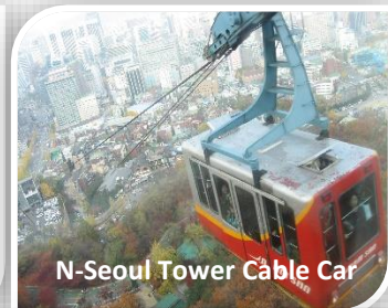
N-Seoul Tower Cable Car