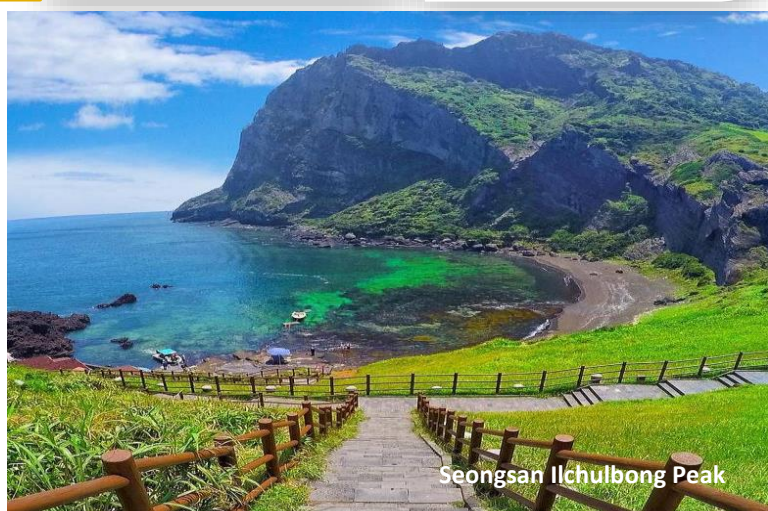
Seongsan Ilchulbong Peak