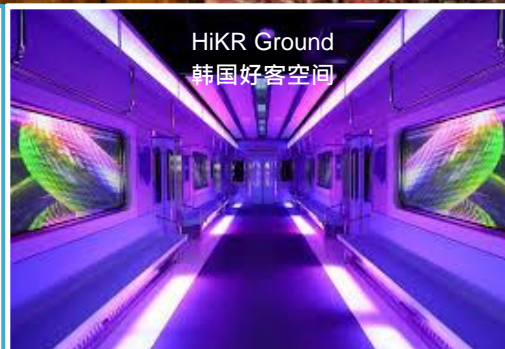
HiKR Ground 韩国好客空间