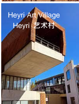
Heyri Art Village Heyri 艺术村