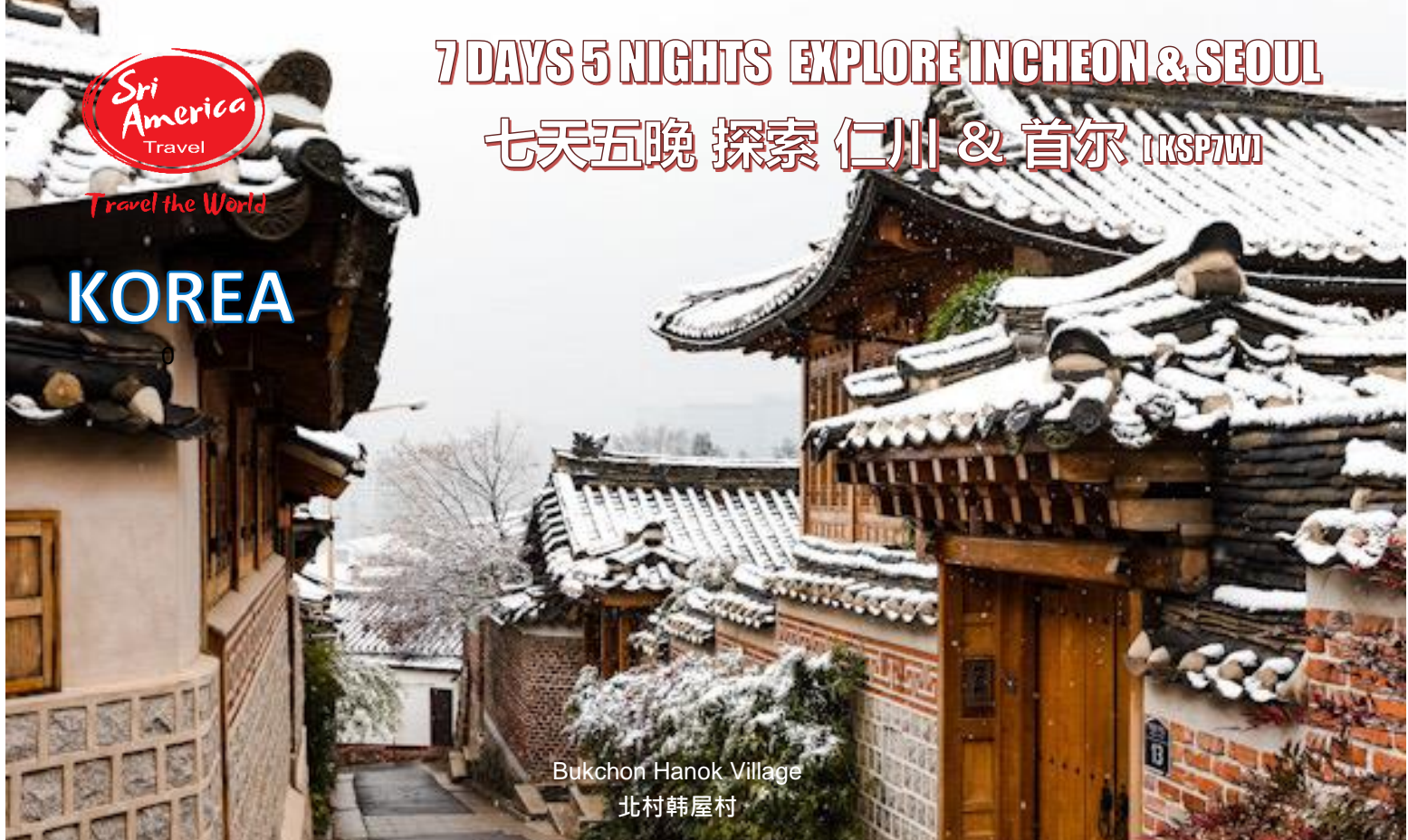
Bukchon Hanok Village 北村韩屋村