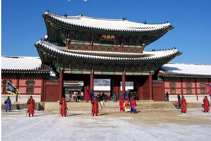
Gyeongbok Palace 景福宫