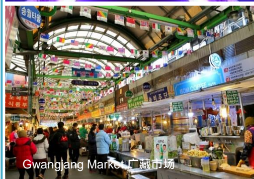
Gwangjang Market 广藏市场