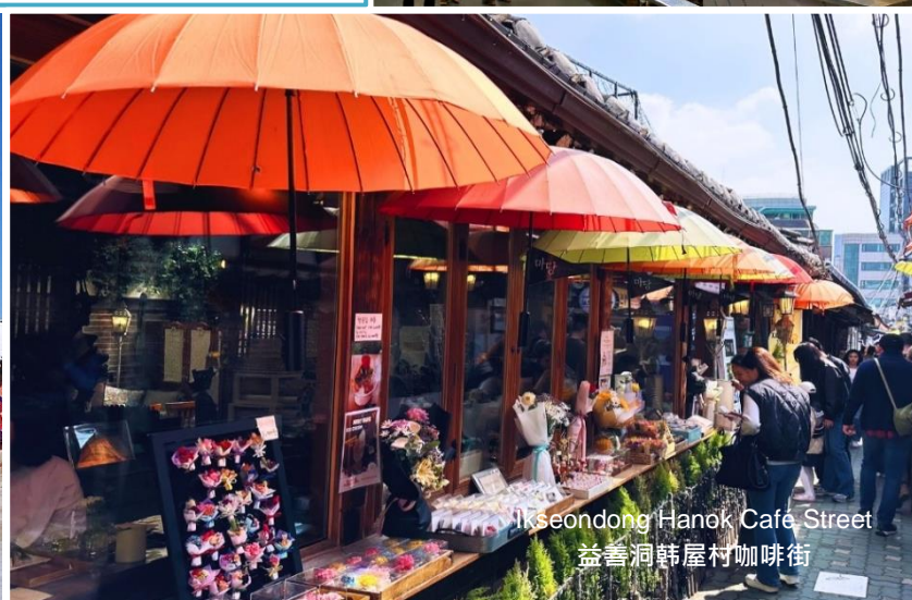
Ikseondong Hanok Cafe Street 益善洞韩屋村咖啡街